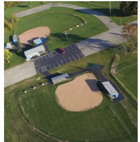
Challenger Complex @Crawford Woods 2400 Hancock Ave Hamilton, OH 45011